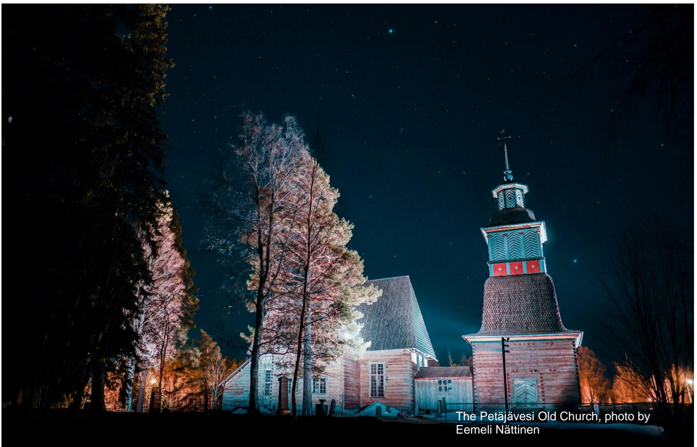
The Petäjävesi Old Church

This FAM trip gives you an idea of the region's cultural gems; Alvar Aalto's architecture and UNESCO sight, a glimpse to the secrets of Northern Lights, refreshing winter activities in our resorts as well as the wellness of the Sauna Region of the World.