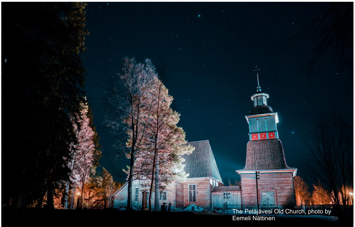
The Petäjävesi Old Church

This FAM trip gives you an idea of the region's cultural gems; Alvar Aalto's architecture and UNESCO sight, a glimpse to the secrets of Northern Lights, refreshing winter activities in our resorts as well as the wellness of the Sauna Region of the World.